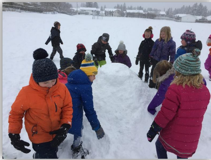
Enjoying the February snow!